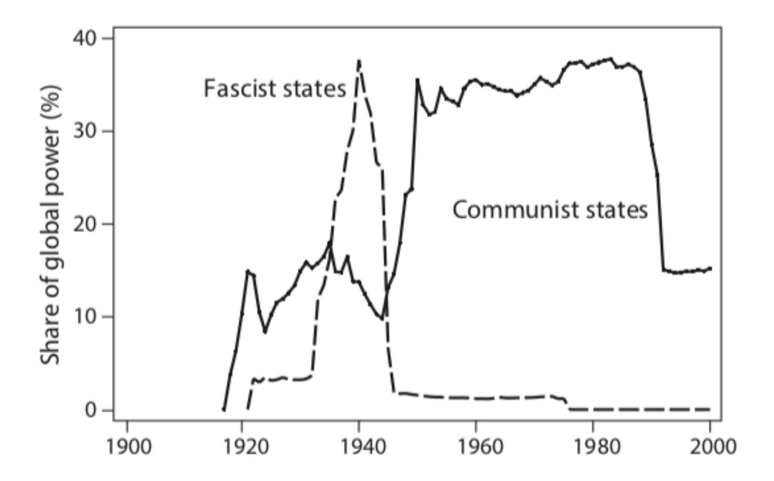
FIGURE 1.2. Communist and fascist shares of global power, 1900–2000.